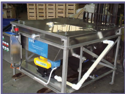
SWA CC5000 Oil Separator Design with integral waste oil tank, pump and control panel.