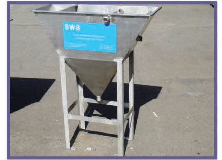
SWA CC1500 Oil Separator

INDUSTRIAL RANGE of Oil Separators are available for flow rates from 10 m 3 /hr to 500 m 3 /hr