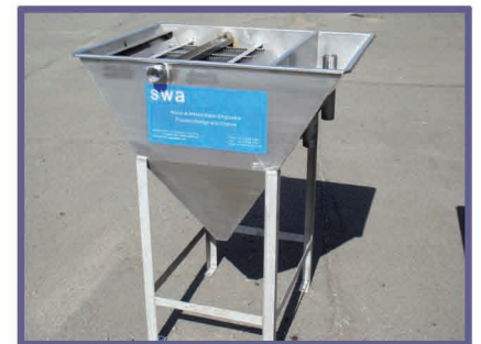
SWA CC3000 Oil Separator