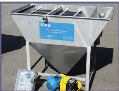
SWA CC5000 Oil Separator