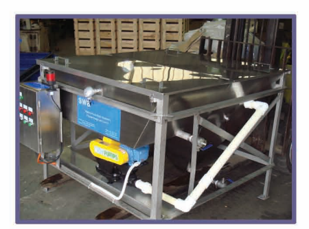
SWA CC5000 Oil Separator Design with integral waste oil tank, pump and control panel.