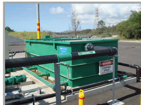
SWA 50 cu.m/h Oil Separator

SWA WATER AUSTRALIA designs, manufactures and constructs industrial waste water treatment plants and manufactures industrial oil separators, solids separators & DAF units. In recent years companies within the SWA Water Group of Companies have manufactured hundreds of Oil Separators, solids separators & DAF units. These projects range from very small separators for workshops and service stations to large oil refineries; from small food processing plants to large abattoirs. SWA has a range of CPI style Oil Separators available as Cross Flow Interceptor (CFI) and Tilted Plate Interceptor (TFI) parallel plate gravity separators.