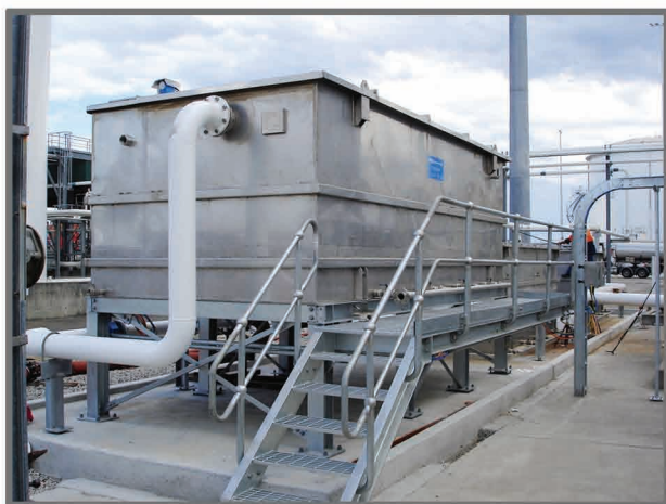
SWA 120 cu.m/h Oil Separator