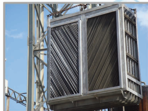
SWA Oil Separator Plate Packs