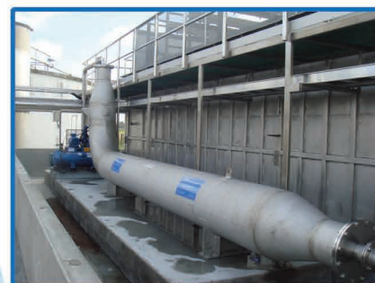
SWA DAF unit ASP