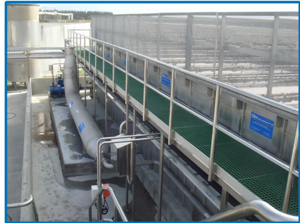
250 cu.m/h DAF unit

All of these features make SWA's DAF units stand out from the rest.