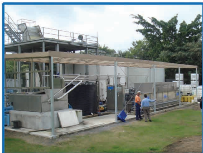
20 cu.m/hr DAF unit