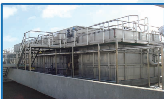
250 cu.m/hr DAF unit