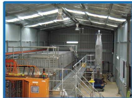
40 cu.m/hr DAF unit