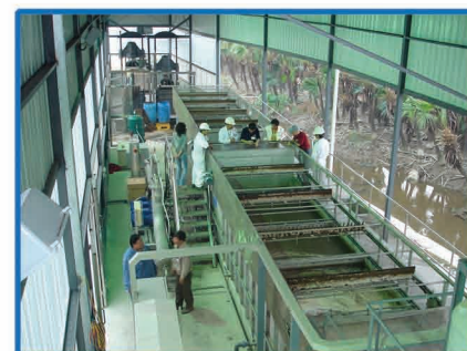
2 OFF 60 cu.m/hr DAF unit