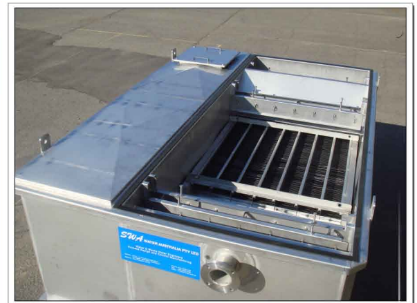
Haywards PS NZ – 75 m3/h Oil Separator