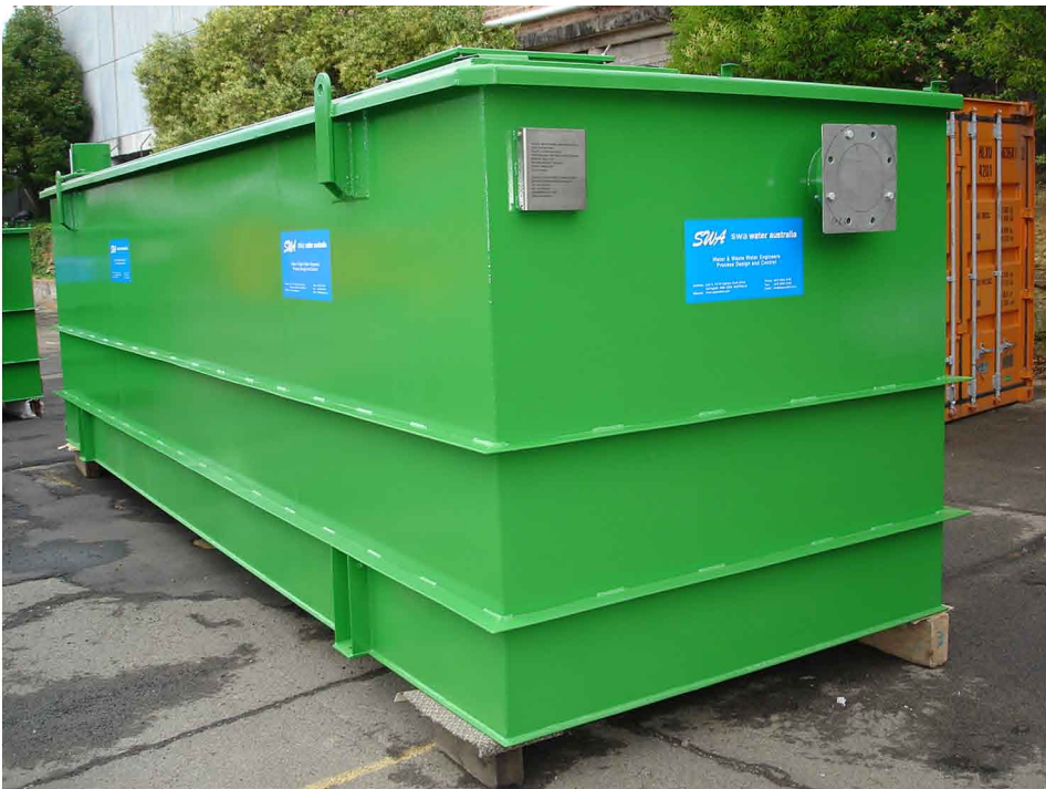
Alstom Fujairah, Power Station SWA Oil Separator 100m 3 /h, 3 off 50m 3 /h