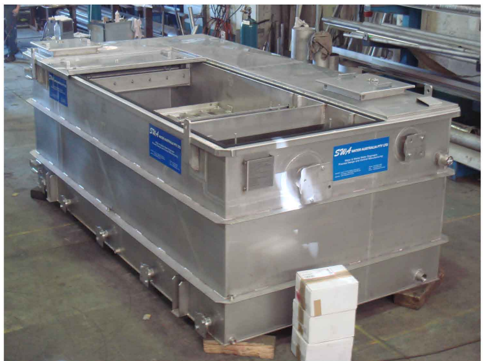
First Gen, Power Station, Philippine SWA Oil Separator, 20m 3 /h

Unit 3, 74-76 Captain Cook Dr. Caringbah, NSW 2229 Australia PO Box 2699 Taren Point SYDNEY NSW 2229 Tel: (61 2) 9525 4788 Fax: (61 2) 9526 2795 Email: sales@swawater.com.au Website: www.swawater.com.au