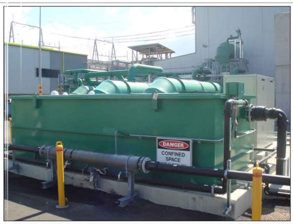
Tallawarra PS, Aust – 60 m3/h Oil Separator

SWA has its oil separators installed in sub-stations & transformer compounds in Australia, Malaysia, New Zealand & Singapore.