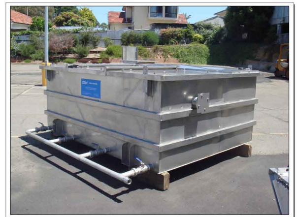
Neerabup PS, Aust – 10 m3/h Oil Separator