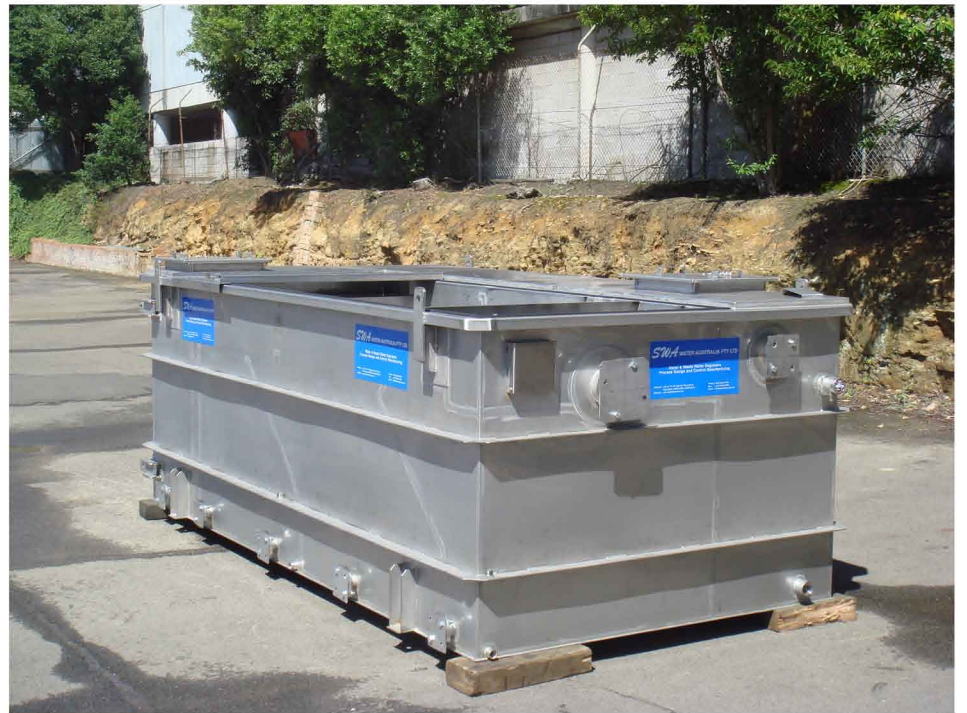
First Gen, Power Station, Philippine SWA Oil Separator, 20m 3 /h