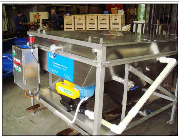
Perling Sub-Station, Malaysia 5 m3/h Oil Separator