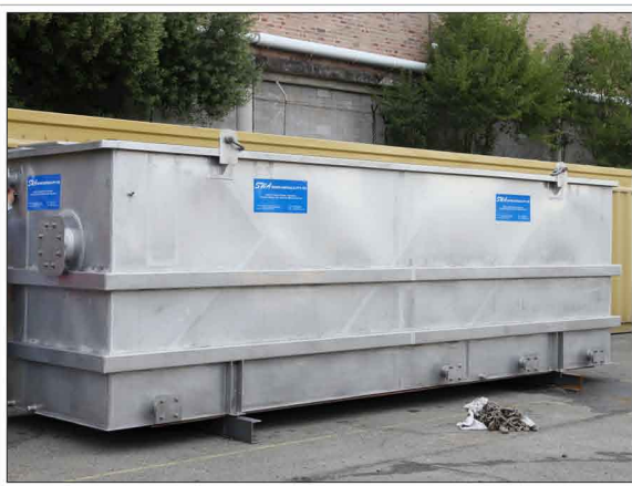
Stratford, NZ – 75 m3/h Oil Separator