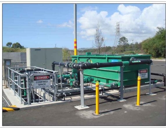
Tallawarra PS, Aust – 60 m3/h Oil Separator