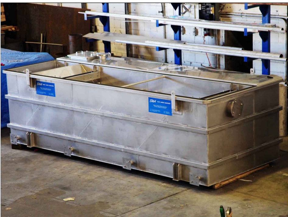
Origin Energy, Power Station, NZ SWA Oil Separator 40m 3 /h