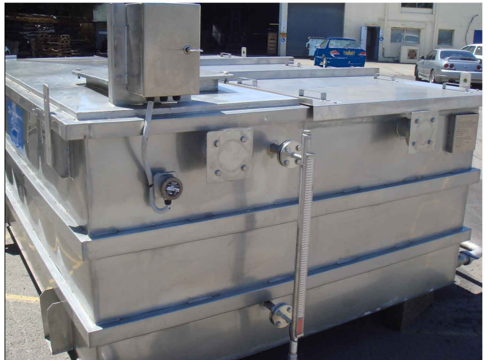
Seraya, Power Station, Singapore SWA Oil Separator 30m 3 /h