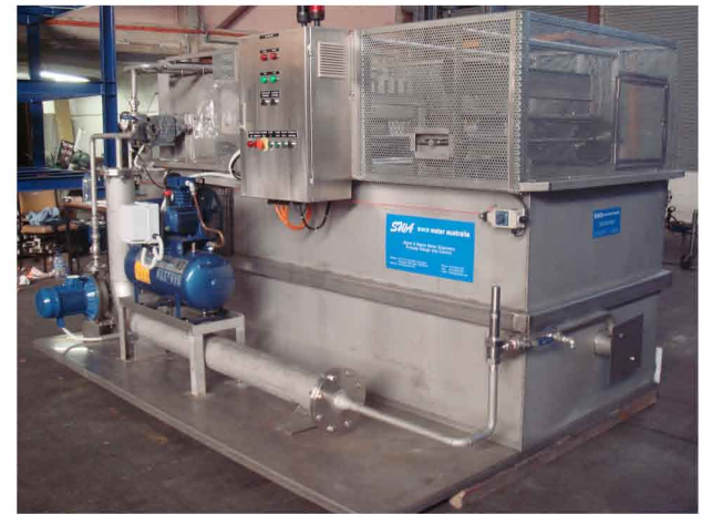
SWA DAF - 10m 3 /h