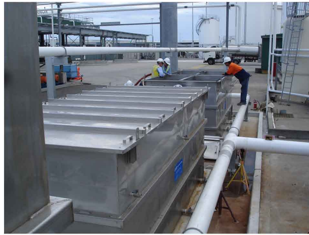
Fuel Terminal, Sydney - 2,800m 3 /d