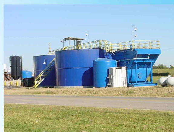
Oil recovery plant, USA - 700 m3/d