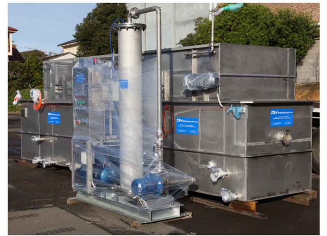
SWA DAF with reaction tank & recycle control system - 20m 3 /h