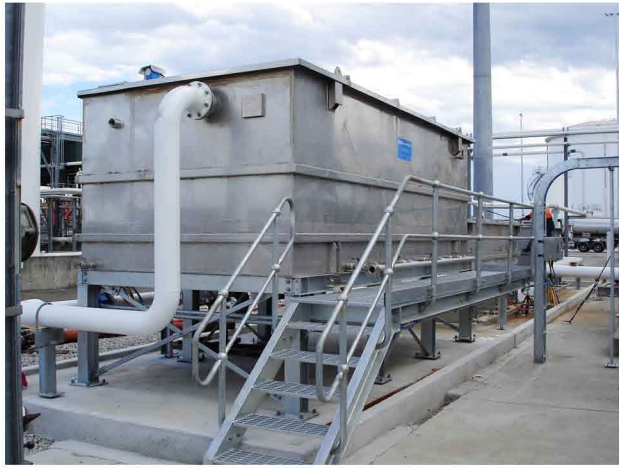
Fuel Terminal, Sydney - 2,800m 3 /d