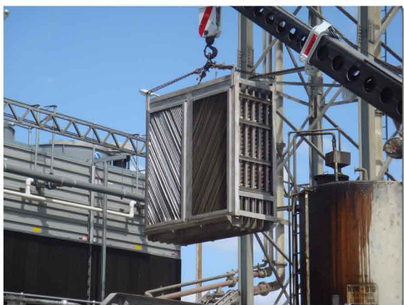
Modular Plate Packs – 240 m3/h