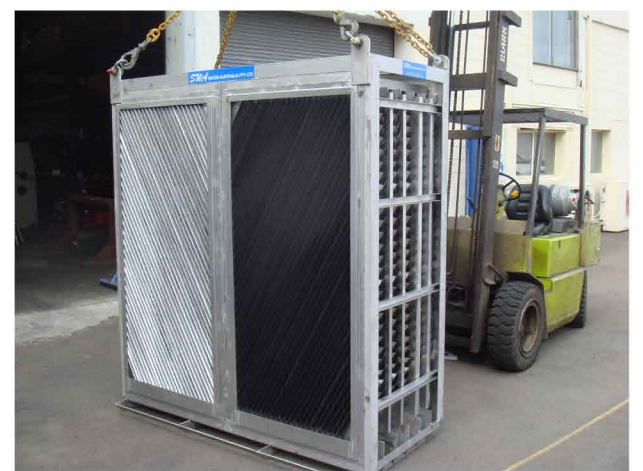
Oil Refinery, concrete tanks with SWA plate pack