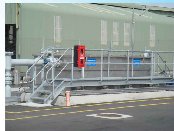
Oil Terminal, NZ - 40 m3/h