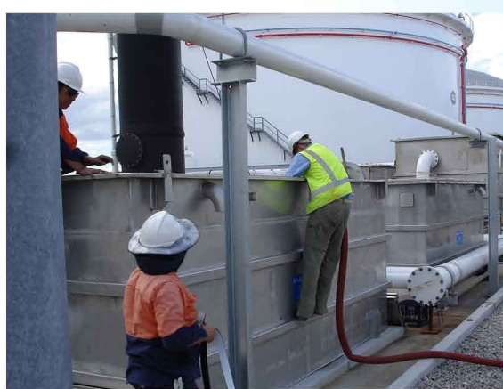
Fuel Terminal, Sydney - 2,800 m3/d