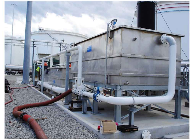
Fuel Terminal, Sydney - 2,800m 3 /d