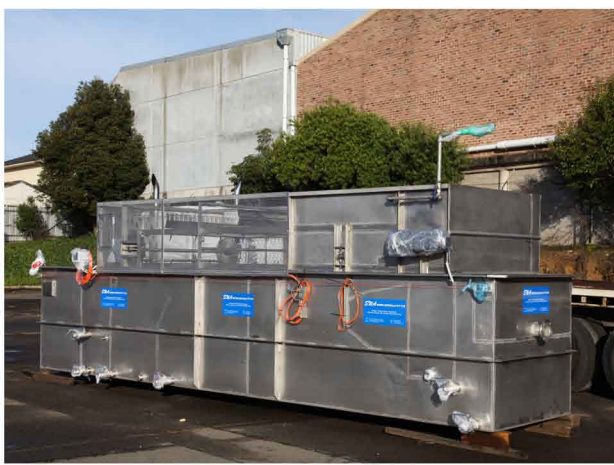
SWA DAF with reaction tank - 20 m 3 /h