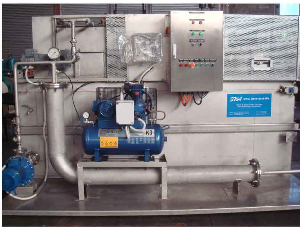
SWA DAF - 10m 3 /h