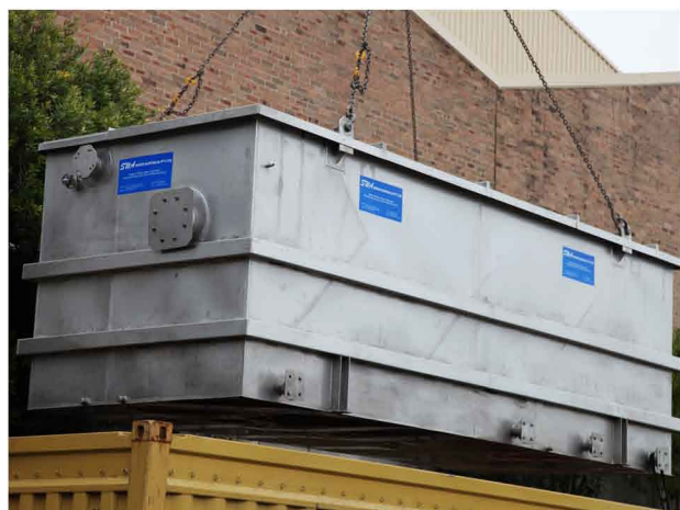
Paratutu Oil Terminal, NZ SS316 60m 3 /h Oil Separator