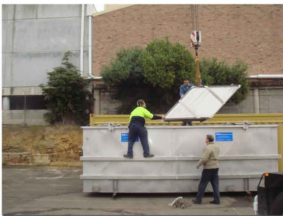
Fuel Terminal, NZ - 60 m3/h