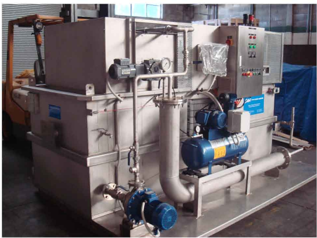
SWA DAF - 10m 3 /h