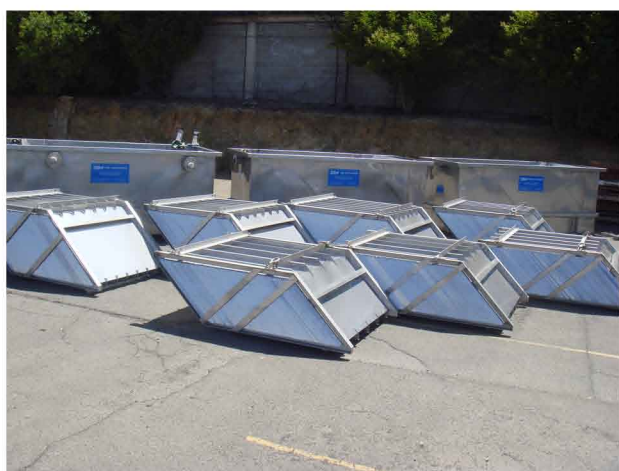
Oil Refinery, concrete tanks with SWA plate pack