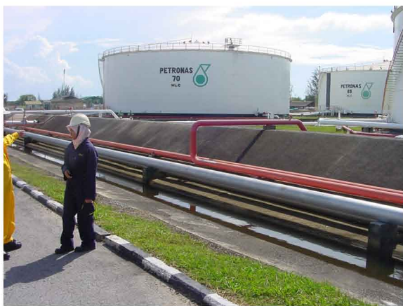
Fuel Terminal, Malaysia - 36,000 m3/d

SWA has plants installed in approx 20 countries including Nigeria & the Middle East, India, China, S E Asia, Australia, NZ, USA & Peru.